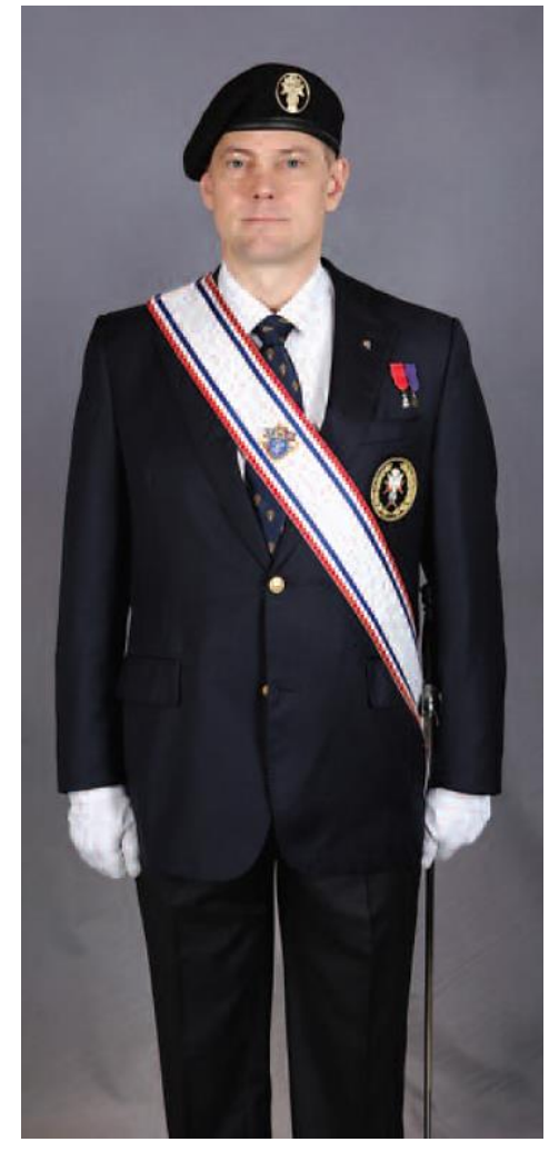
ORD – CC (Service)