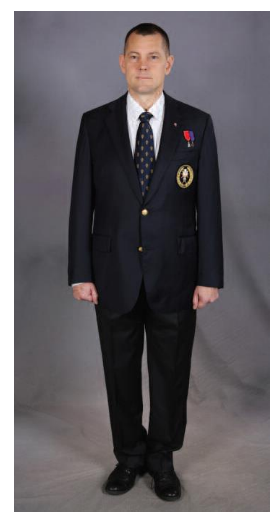
ORD – Member ( Social )