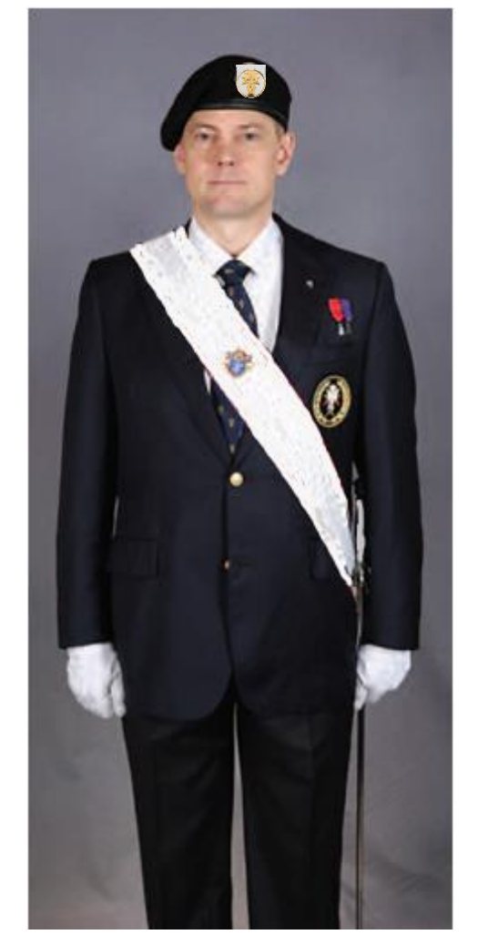
ORD - CC, FN