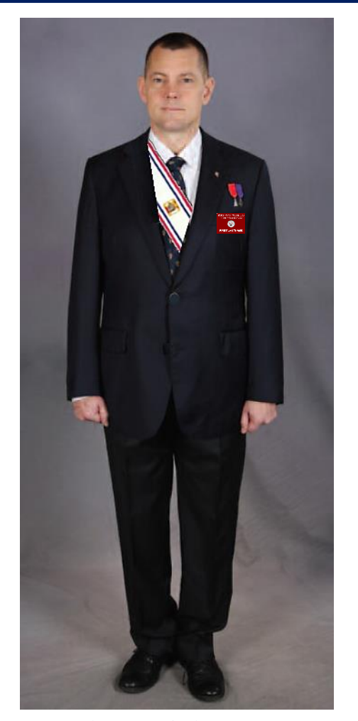
aka Social Dress

*Note that the term suit generally means the coat and trousers are of the same material and color. The term suit is not interpreted to mean sport coat and trousers where either the colors or materials are different from one another.