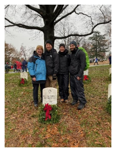
The Leach Family places a wreath at Eleanor's father's grave