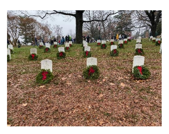
Wreaths covering the graves!